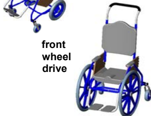
front wheel drive